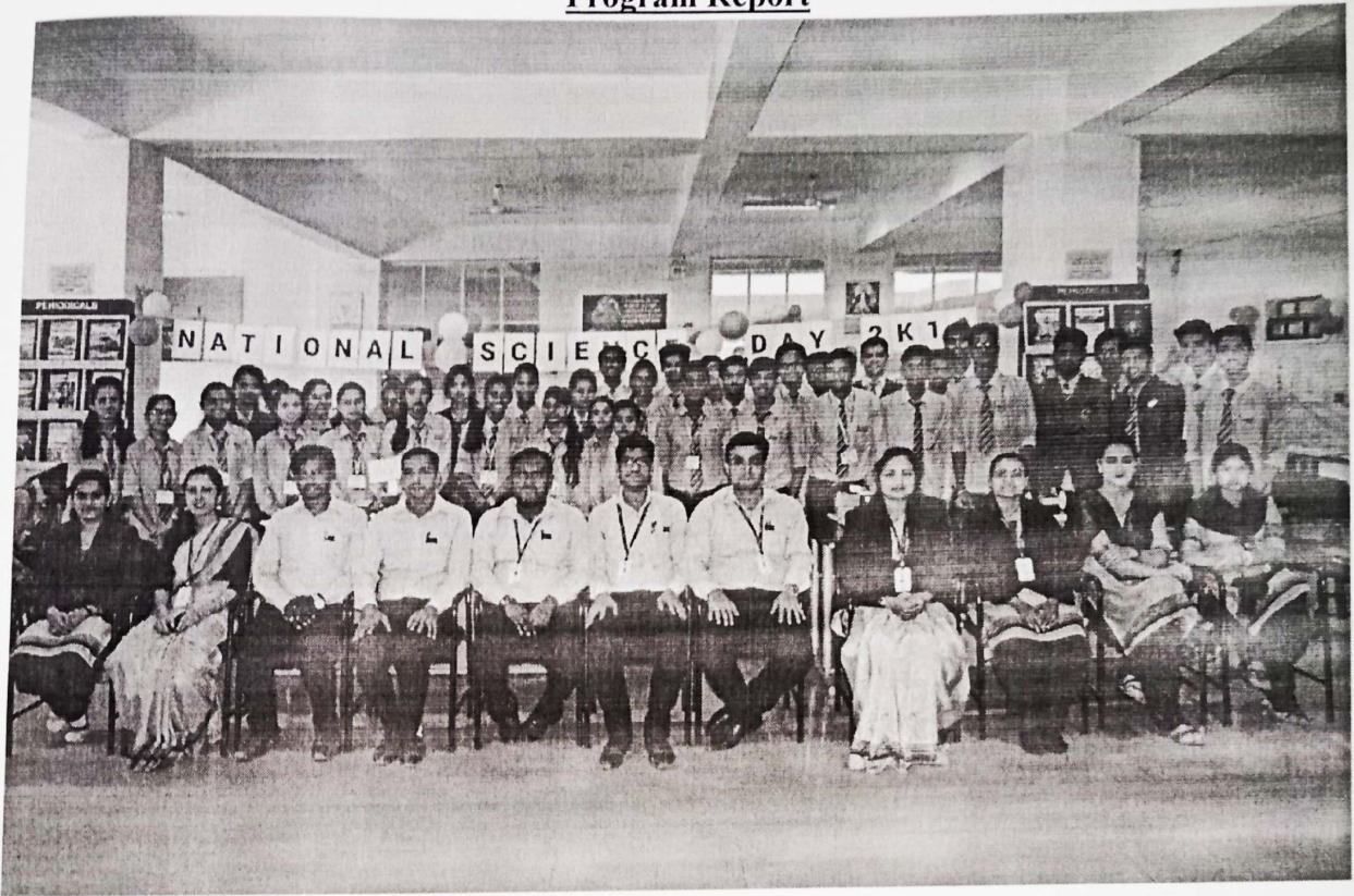
Team of volunteers & participant along with faculties of BES Department