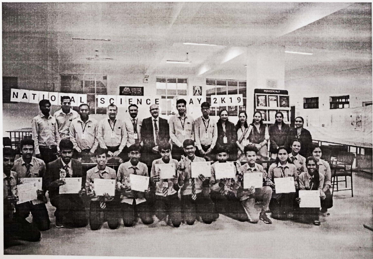
Winners along with Principal, Vice – Principal, HOD & Staff members of BES Department